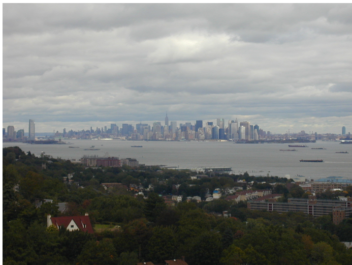
Manhattan as seen from Harbor View Dorm at Wagner College. Makes great wallpaper...(note Statue of Liberty at left.)